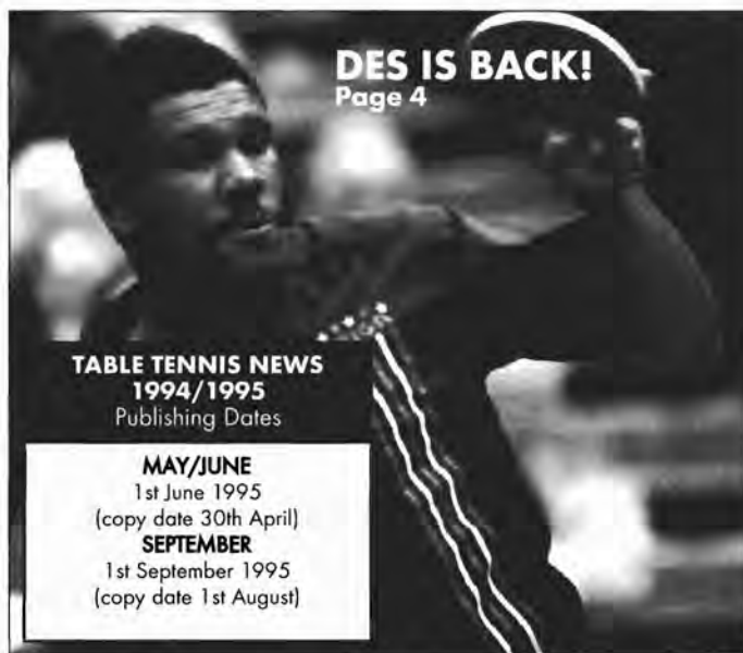
TABLE TENNIS NEWS 1994/1995 Publishing Dates

MAY/JUNE 1st June 1995 (copy date 30th April) SEPTEMBER 1st September 1995 (copy date 1st August)